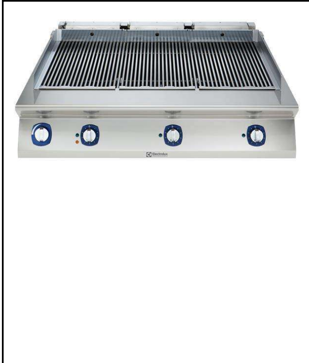
371268 (E7GRELGS0P) Large electric Grill Top - HP